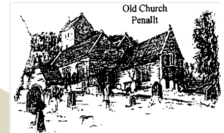
Old Church Penallt

Visitors to Our Churches are always welcome – “Come unto me all who seek rest for their souls.”